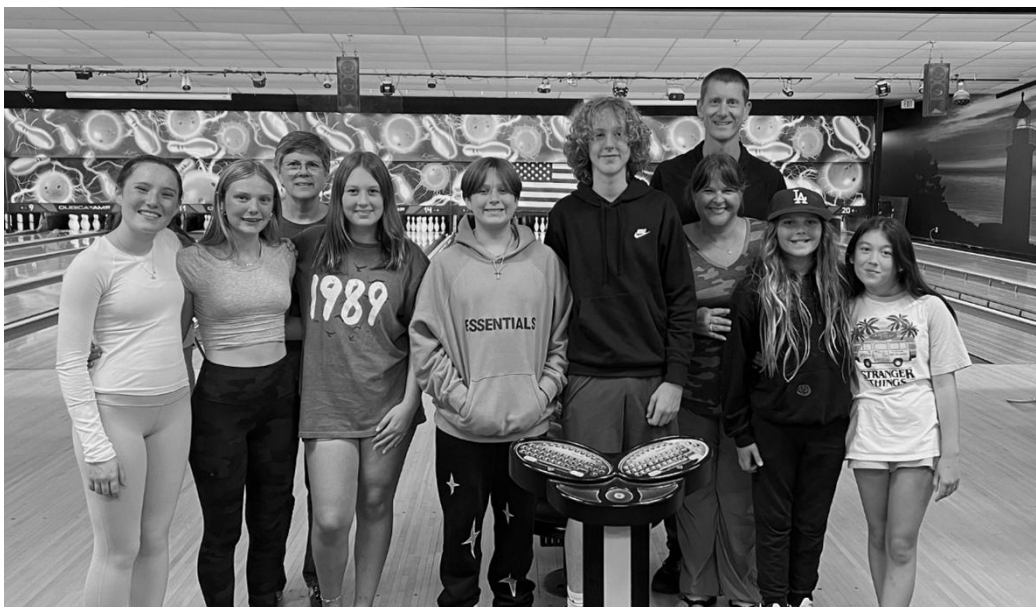
Youth Fellowship Bowling Party