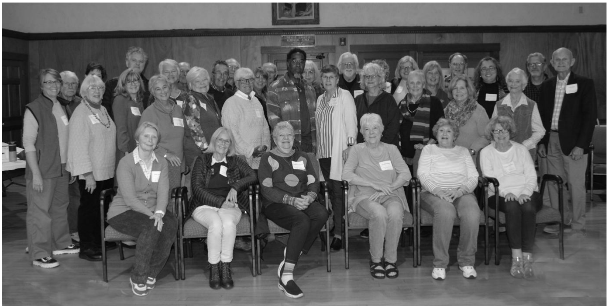
"Building the Beloved Community participants in the morning workshop presented at DUC by the CT Center for Non-Violence on October 19, 2024 at DUC.