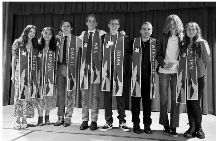
The 2023 Confirmation Class was received April 16, 2023